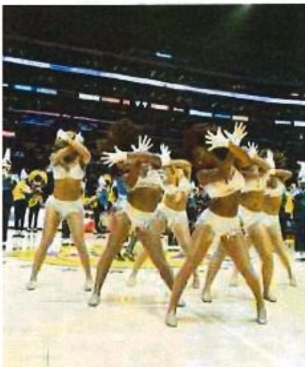
SU Dancing Dolls at LA Lakers game