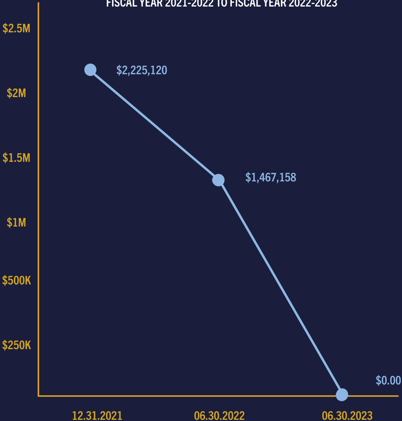
FISCAL YEAR 2021-2022 TO FISCAL YEAR 2022-2023