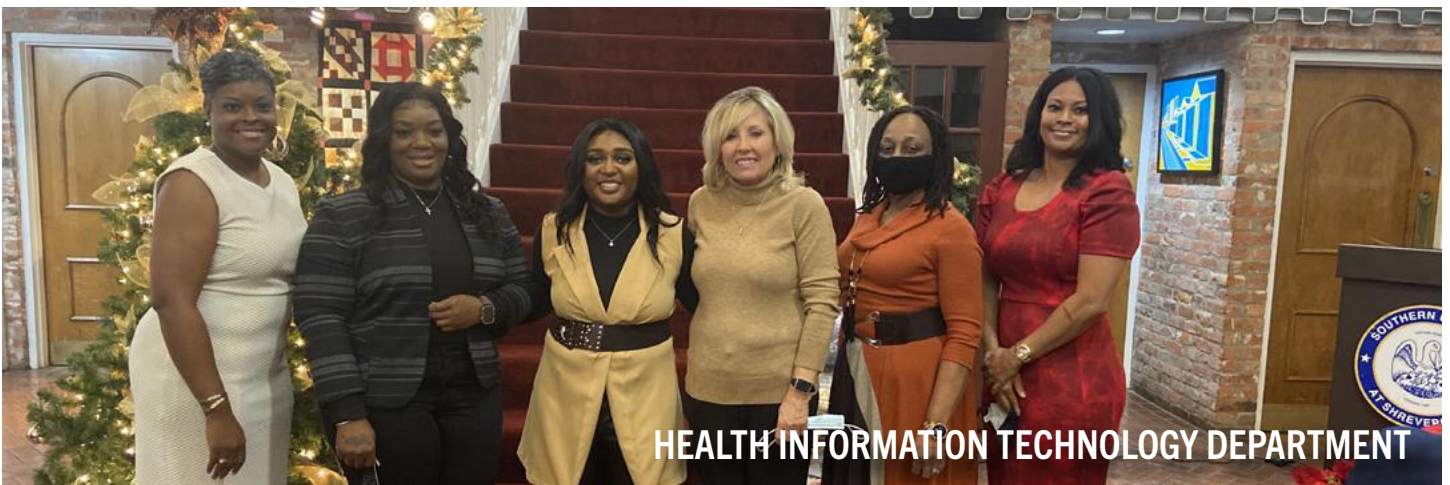
HEALTH INFORMATION TECHNOLOGY DEPARTMENT