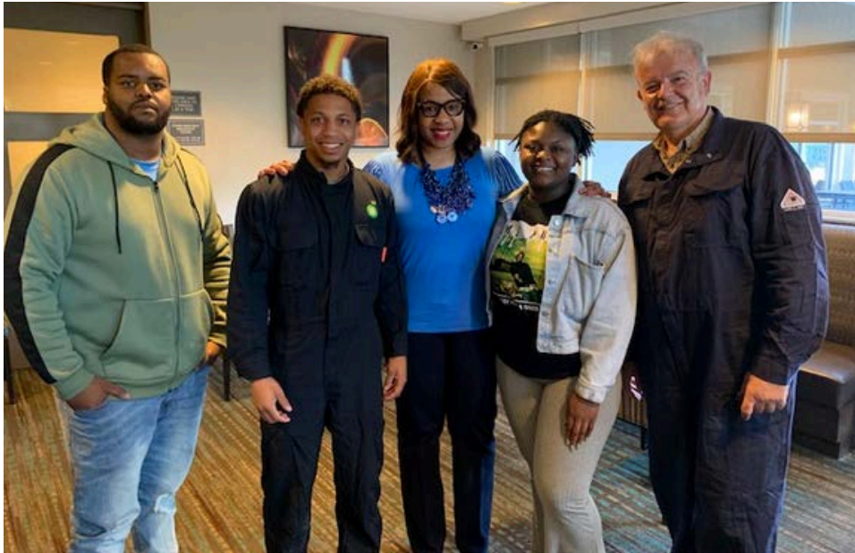
The BPX Energy and SUSLA Team at the BPX Energy Onshore training in Shreveport, LA