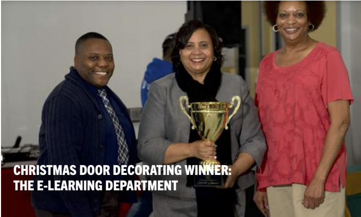
CHRISTMAS DOOR DECORATING WINNER: THE E-LEARNING DEPARTMENT

JAGUAR OF THE YEAR & HOLIDAY DOOR DECORATING CONTEST | WINNERS WILL BE ANNOUNCED