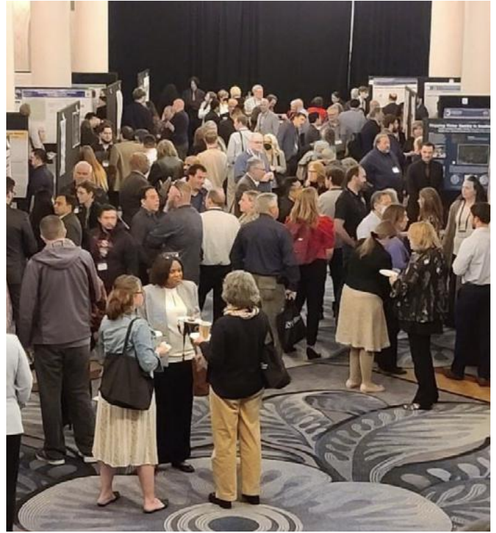
PICTURED: STUDENT POSTER SESSION AT THE NATIONAL SCIENCE FOUNDATION (NSF) ADVANCEMENT OF TECHNOLOGICAL EDUCATION (ATE) PRINCIPAL INVESTIGATOR CONFERENCE IN WASHINGTON, D.C.