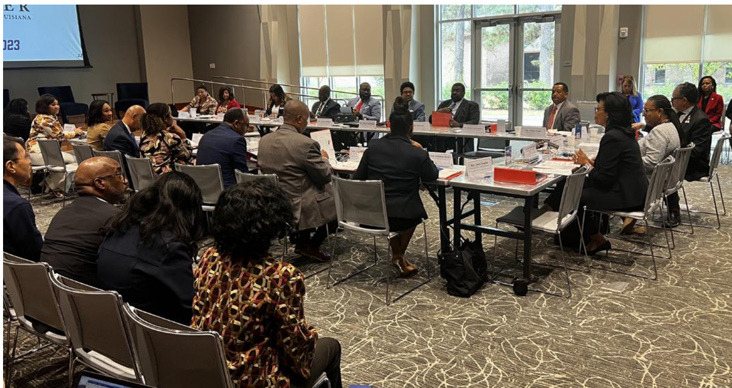
PICTURED ON COVER: SUSLA'S FALL 2022 ENROLLMENT INFOGRAPH