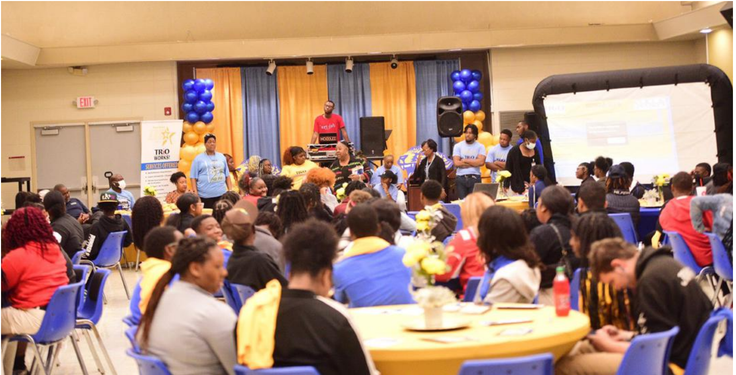
PICTURED: CADDO PARISH HIGH SCHOOLERS ENJOYING THEIR WELCOME TO SOUTHERN UNIVERSITY AT SHREVEPORT BY THE TRIO EDUCATIONAL TALENT SEARCH PROGRAM TEAM

Once again, TRiO's Educational Talent Search (ETS) Program had a very successful SUSLA Annual College Tour and FAFSA workshop! On October 4-6, 2022, ETS hosted the following high schools: Booker T. Washington, Green Oaks Performing Arts Academy, Red River, Magnolia, Arcadia, and Woodlawn Leadership Academy. The 11th and 12th-grade students took an extensive tour of Southern University at Shreveport. The staff from Student Affairs and Enrollment Management, Financial Aid, Students Support Services, Student Activities, and the SGA assisted the ETS staff in hosting visiting students. The members of the SUSLA's cheerleading squad had a dance contest with different dance groups from the visiting schools. This experience allowed our visiting students to meet with SUSLA's staff and complete the Free Application for Federal Student Aid (FAFSA).