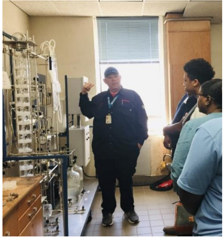
PICTURED: PTEC STUDENTS AND TOUR GUIDE IN THE EXXONMOBIL DISTILLATION LAB

On September 23, 2022, ExxonMobil hosted SUSLA's Department of Engineering & Technology Process/ Petroleum Technology (PTEC) program students and faculty at their Baton Rouge, LA refinery. A brief overview of the refinery and refinery operations was provided during a guided tour, after which students learned about the role of Process Operators and how Operators integrate into the refinery's day-to-day activities. Students also visited the training facility and interacted with ExxonMobil's VR training modules, where they could perform tasks in virtual reality. The visit was such an impressive experience that it convinced the participating students to pursue a Process/Petroleum Technology (PTEC) degree. We thank ExxonMobil for its continued support of the Process and Petroleum Technology program at Southern University at Shreveport.